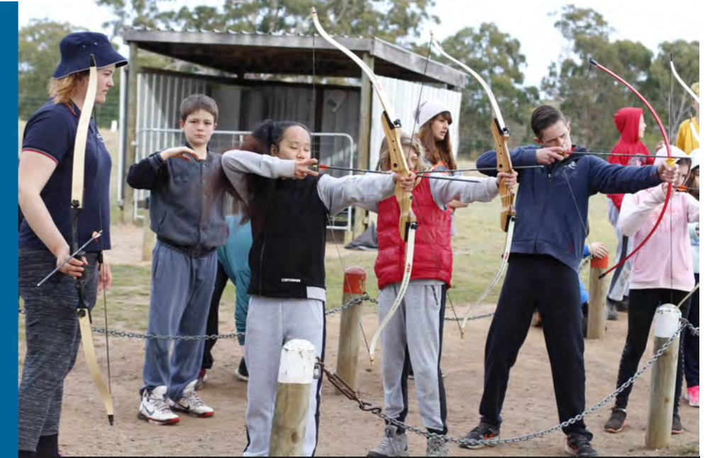
Running an Archery session

Although Coolamatong are not able to cover these costs, we are willing to partner with you and guide you through this formal process.