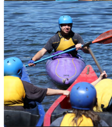
TOP: Camper cuddling a chook