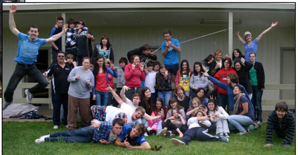
Left picture: Campers during our Community Action Day—cleaning up a park in Bairnsdale.